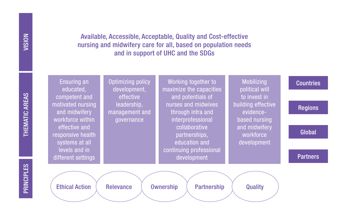
Figure 1. WHO Global strategic directions for strengthening nursing and midwifery 2016–2020 : conceptual framework